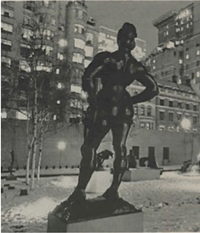
Figure 4: PULSA, untitled, view of installation at MoMA Sculpture Gardens, 1970.

the computer. Other input devices included: photo cells and meteorological instruments that sent information directly to a signal generator, microphones providing direct feedback to loudspeakers, and photocells in direct feedback loops with the infrared heater clusters. A primary objective of this installation to create an open, sensorial, participatory experience that was determined, and in essence, designed by, the movements and sounds of the exhibition visitors circulating and observing within the urban garden environment.