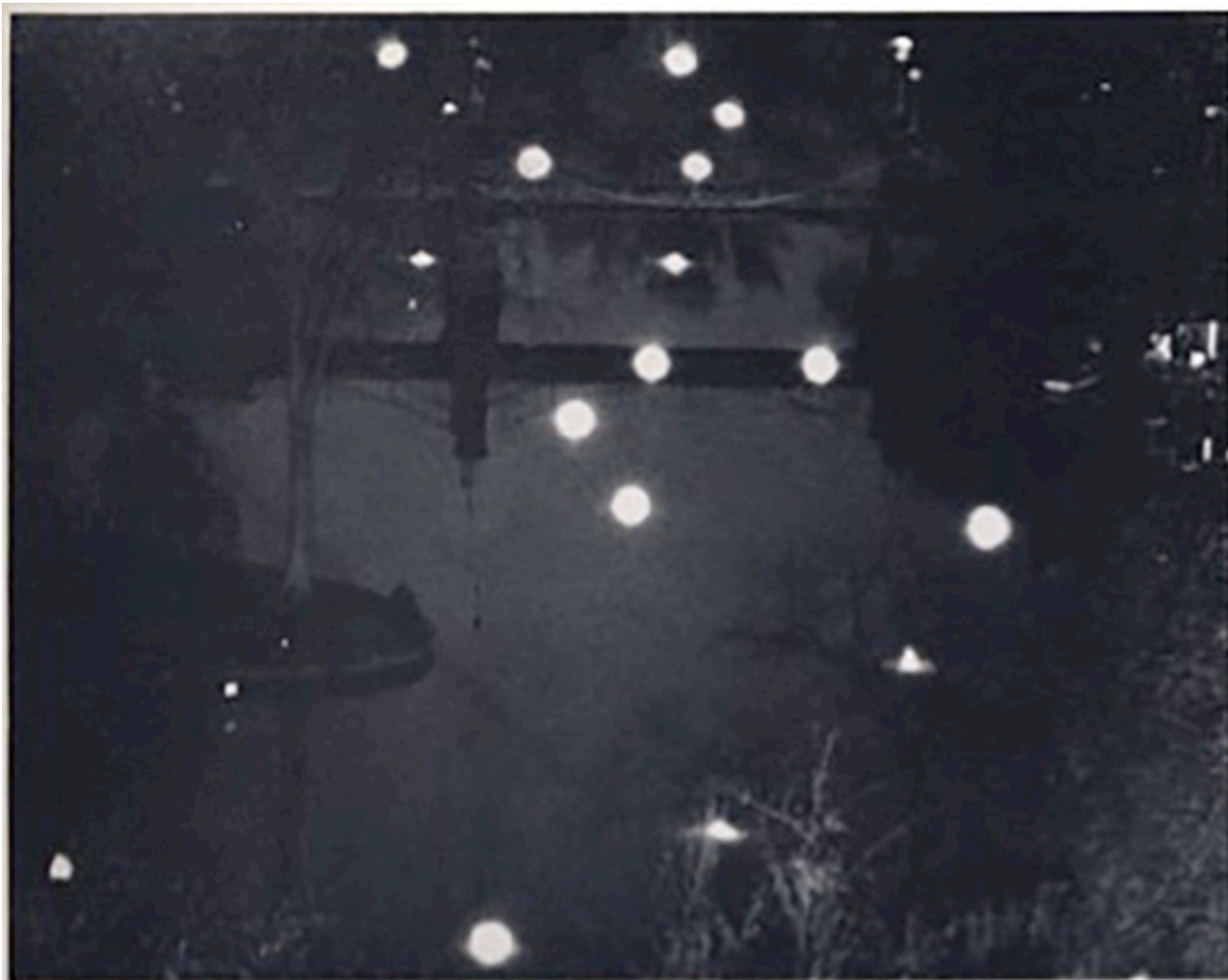
Figure 3: PULSA, untitled, "Programmed Environment," (view of sound-light installation, Boston Public Gardens), 1968.

The intention of this work, according to the artists, was to "integrate technological activities which characterize the functioning of the city with the city's physical structure." 13 The group attempted to demonstrate how public art should address all parameters of the urban and technological environment as "potential media for artistic expression in order to introduce these concepts on a large scale" and be realized as important factors when architects, urban designers, and planners design cities. 14