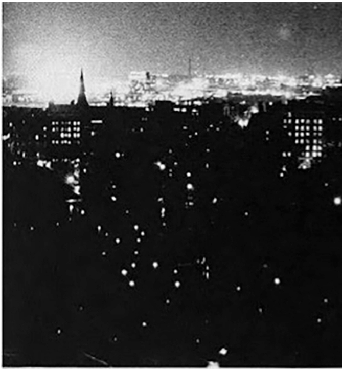
Figure 2: PULSA, untitled (view of sound-light installation, Boston Public Gardens), 1968.

the term, blurring boundaries between various scales of design - from industrial design of objects and machines to urban and regional planning. 'Environment' soon emerged as a phrase for McLuhan to explain the realm of media. It is not by chance that an article by McLuhan, titled "The Invisible Environment," was published in the Yale School of Architecture Journal, Perspecta 11 shortly after the Argus installation. Writing about the computer in society at that time, he states: "I think the computer is admirably suited to the artistic programming of such an environment, of taking over the task of programming the environment itself as a work of art, instead of programming the content as a work of art." Here the new invisible environments brought about through new technologies will reveal the old environments, and in the process, create works of art. 5